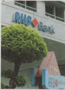
Four local banks including RHB Bank are leading the charge in embracing technology to expand their customer reach and increase their presence in the digital world.